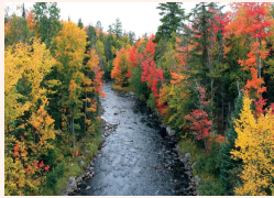
Date February 24, 2020