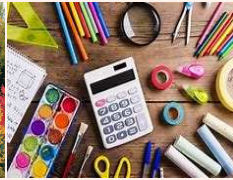
Day # A-1