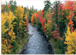
Date September 9, 2020