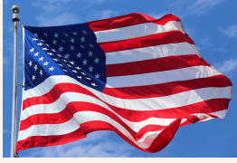
Pledge of Allegiance