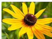
Black Eyed Susan